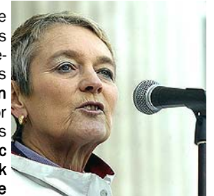
By Anne Campbell

leave Iraq. Our Department for International Development is funding projects to get public sector employees back to work and rebuild the infrastructure in southern Iraq. I opposed the war in Iraq but, unlike the Lib Dems, I want to focus the debate on to the needs of the Iraqi people and the resources required to develop their country. That is the pressing, immediate concern and only Labour has a proven track record of championing international development."